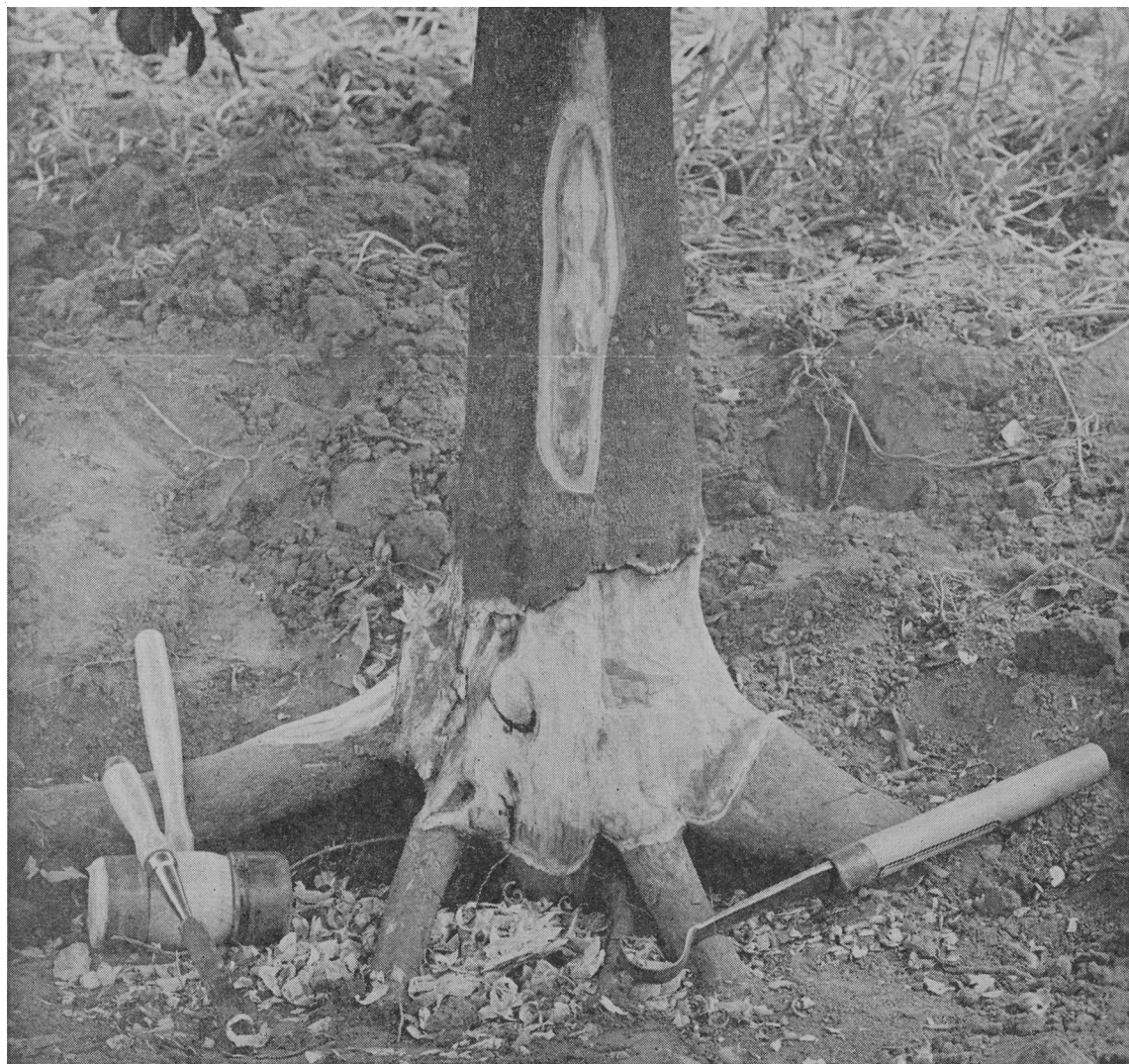
A 19-year-old orange tree injured by spraying with kerosene. Emulsions of the lighter fractions of kerosene sometimes prove disastrous because they are apt to run down the trunks of the trees and kill the bark, just below the surface of the soil.

If the plant does not have access to adequate supplies of any one or more of these necessities, it can not form the sugars, starches, proteins, and the other substances which are indispensable for its growth and for