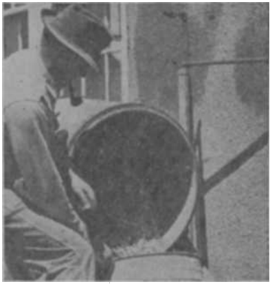
Illustrating the method used in removing the beans from the cooker. Note the steam pipe disconnected.

Steaming requires much less labor than boiling in open kettles and the final product is just as valuable.