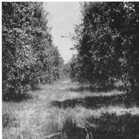
Low-hanging branches prevent uniform distribution of water.

Incidence of fungus diseases has not been serious even where the sprinklers