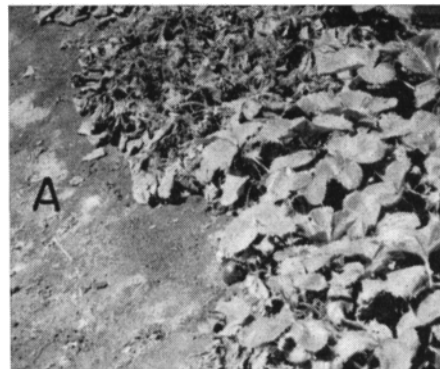
Strawberry plants in the process of being destroyed by extreme salt accumulation conditions. The sharp change in color—A—is the point where salt accumulation begins.

and vigor of the plants, however, were not visibly affected. In the case of the comparable furrow irrigated plot there was a considerable accumulation of salt, the maximum being about 2½ times that of the sprinkler irrigated plots. The plants in the furrow irrigated plots were slightly smaller and less vigorous than those of the sprinkled plot. The first harvest yield of the sprinkler irrigated plot was 18% higher than that of the furrow irrigated plot. Probably the original low levels of salts in the soil could not be maintained by sprinkling because of water quality. However, under furrow irrigation the salt content did rise to much higher levels and the difference in salt levels brought about the differences of yield.