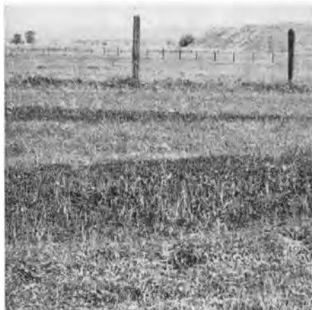
Response of seeded annual clovers to the application of phosphate fertilizer—dark strips. Photo was taken March 30, 1953, in Field No. 3 after 40 days without rain.

The ranch is in the 20" annual rainfall zone, and over 80% of the rain occurs during the months of November through March. The soil is gently undulating terrace land, classified as Placentia gravelly