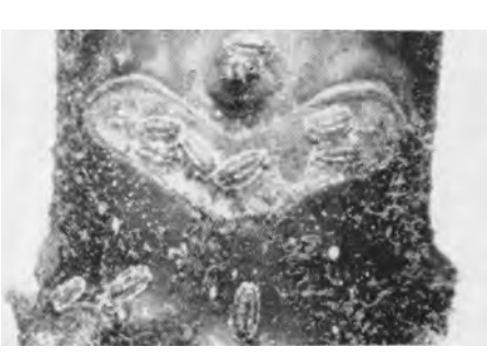
Young of the calico scale as they appear in early November. Note the six scales on the leaf scar. (x6)

crops grown in adjacent fields. Where materials such as DDT dusts are applied to these crops and there is a drift of the dust through the orchard, induced increase in the soft scale population can be expected. Where this occurs the heaviest scale infestation is usually found on the side of the walnut orchard next to the treated field. The seriousness of the situation depends to a large extent upon the number of treatments applied, the timing, and the intensity of the dust drift.