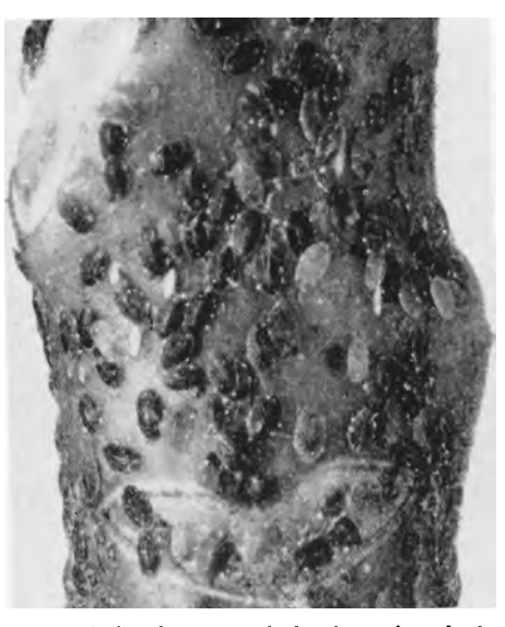
Stage of development of the frosted scale in early November. Compare size of scale with leaf scars. (x6)

When the systemic aphicides—Systox and OMPA-are used in the spring they exhibit some residual suppressive action. With Systox there is a high mortality of the crawlers that attempt to settle on the twig growth and the leaf petioles, but not of those that settle on the leaflets. With OMPA-not registered for commercial use-the same situation occurs but there is a reduced survival of the crawlers that move to the leaflets. With both materials the survival is greatest on the growth in the center of the trees. In these locations the crawlers may survive in large numbers on the twigs and leaf petioles. Tree vigor seems to influence the effectiveness of these materials, particularly OMPA. Scale suppression also appears to be associated with the dosage used. This again seems much more important with OMPA than with Systox. Although both materials show a tendency toward scale control, only OMPA, under certain conditions, results in effective suppression of the pest. Despite the killing action of Systox, the scale population tends to reach a destructive level, and in fact it appears as if Systox encourages this. Just why this should occur remains to be explained.