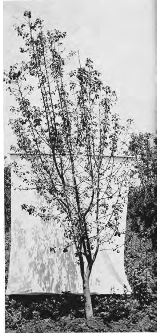
Left: Old Home tree showing severe decline. Initially propagated on quince

On July 19 the soil was washed away from the roots of five sick trees and five healthy trees by the use of water from a high pressure sprayer. After the roots were washed clean, the walnut-brown bark of Old Home roots and their position above the bud union distinguished them from the blackish-brown quince