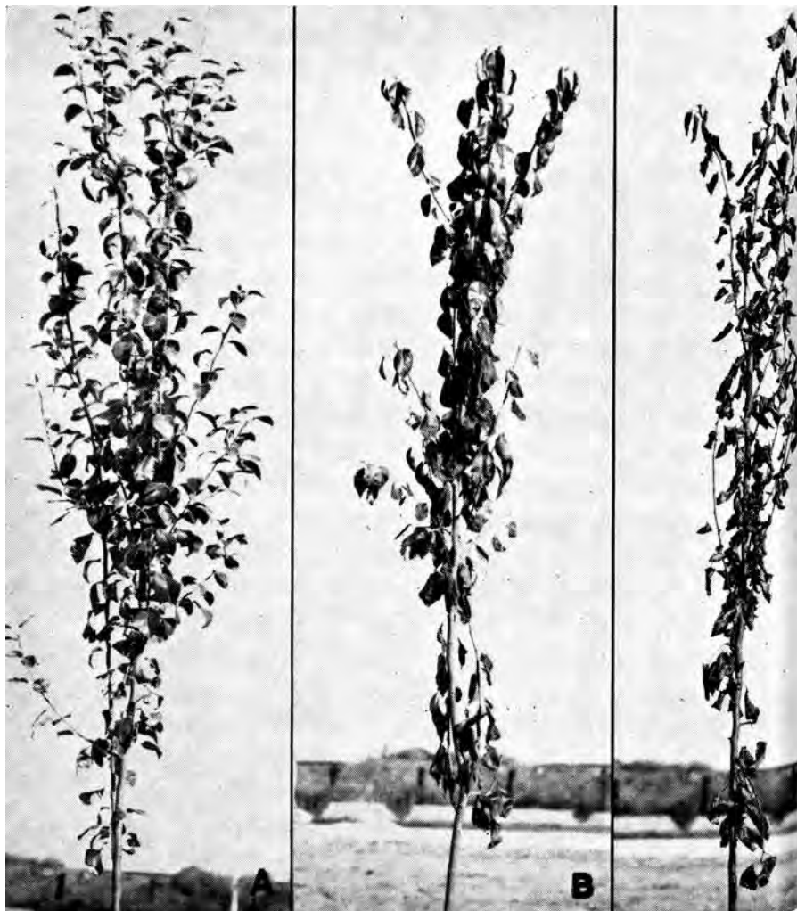
Two-year-old Bartlett pear trees on P. serotina roots used for the transmission experiment in screenhouse. (A) apparently healthy control; (B) inoculated tree in initial stage of wilting; (C) inoculated tree with typical symptoms of quick decline shown several weeks after the onset of wilting.

T. A. SHALLA • T. W. CARROLL • LUIGI CHIARAPPA