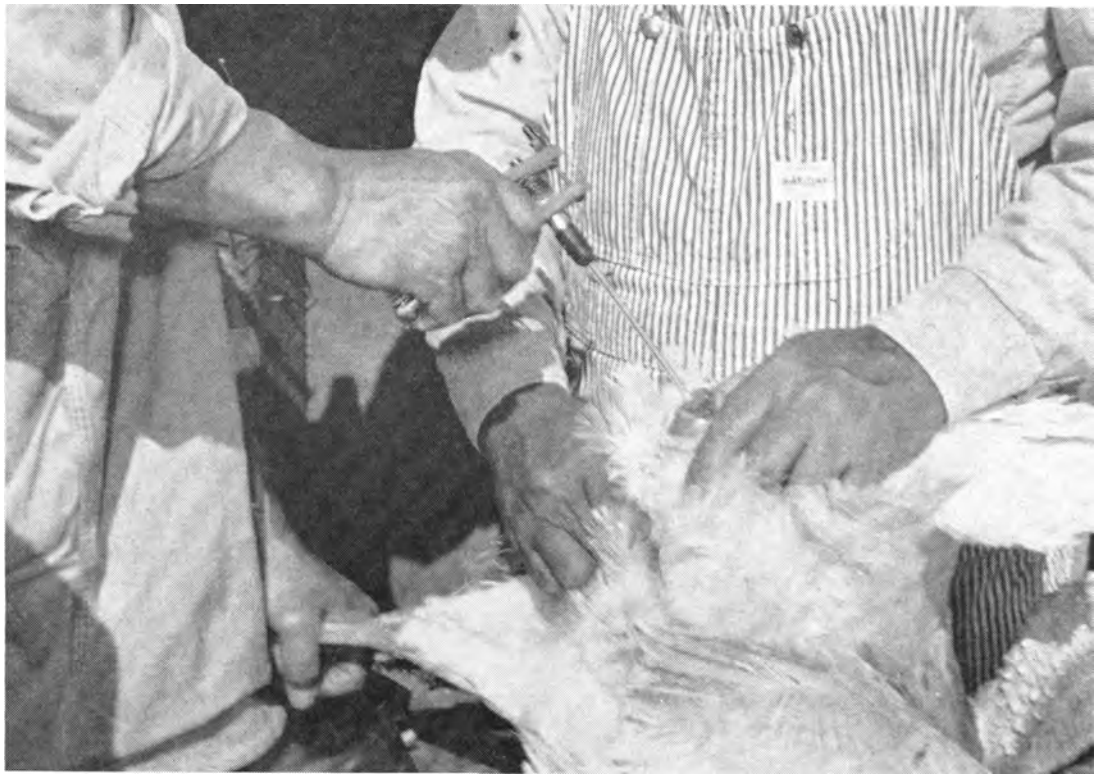
Insemination is commonly used to improve fertility in heavy strains of turkeys. The two men in photo above are using a plastic tube technique to inseminate a turkey hen.