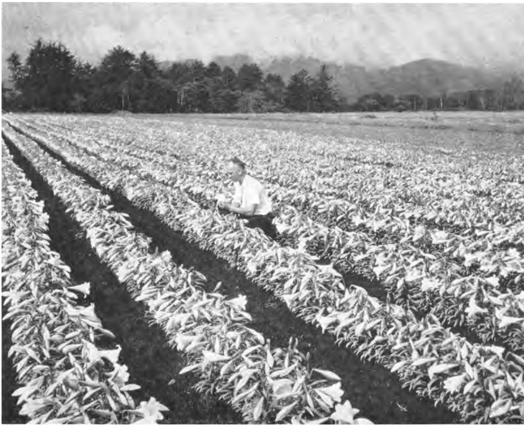
A view of a field of Easter lilies in full bloom at Boroughs Farm, Smith River, California. This photograph was taken in early July on a cool and foggy day, which is typical of that bulb-growing region.

M ORE THAN 7½ million Easter lily bulbs are produced in coastal northern California and southern Oregon. This figure represents 75% of all the lily bulbs produced in the United States for eventual use as potted plants and cut flowers. In addition to the bulb industry, vast numbers of flowering potted plants are forced by California nurserymen for Easter sales.