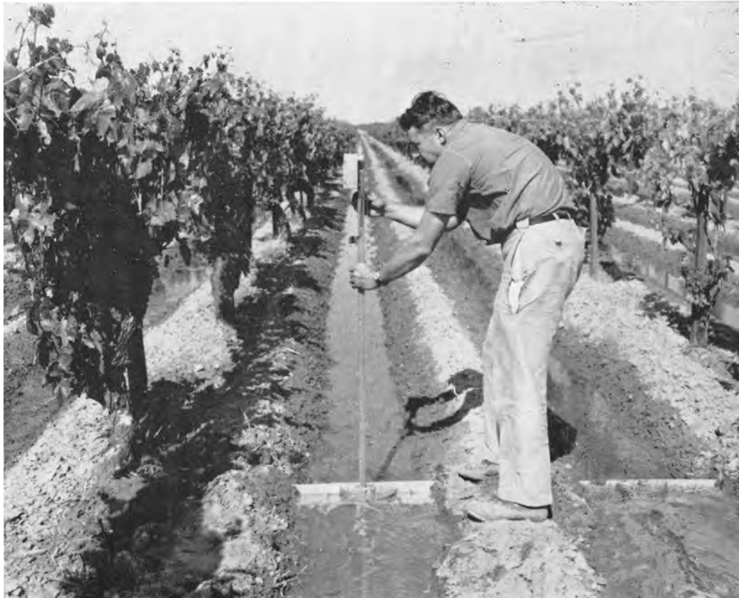
Measuring furrow flow with orifice plate and electric point gauge at Kearney Field Station during studies of water penetration in vineyards.

The analysis of the trial soils in table 1 indicates neutral pH values and lack of an alkali (high sodium) problem. Both irrigation waters (table 2) were low in salts and sodium and had moderate bicarbonate levels, especially at Fresno State College. The analysis of irrigation waters