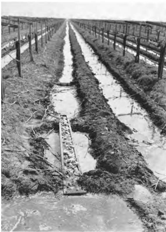
Dissolving gypsum in irrigation water using a trough filled with rock gypsum in tests at Fresno State College vineyard.