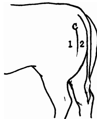
The crease (C) is between the semitendinosus (1) and the semimembranosus (2) rump muscles.

Sighting through rump gage to match one of four outlines to the animal's rump shape.