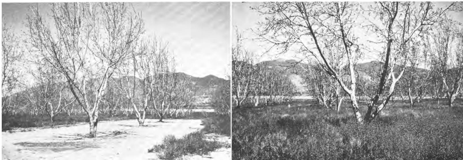
Pre-emergence control of annual weeds in walnuts with simazine in test plot to left, as compared with check (untreated) plot to right.

Fifteen sets of field tests were designed to evaluate tree tolerance and weed control, and to provide residue information. Generally, simazine and diuron were each applied at rates of 2, 4, and 8 lbs (2.5, 5 and 10 lbs of the 80% wettable powder) per acre in the fall, followed by second applications of the 2- and 4-lb rates in the spring. Plots at some locations received only the fall treatment, at other locations only the spring treatment, and still others received both fall and spring applications: Tests were continued at three locations for two years and at one