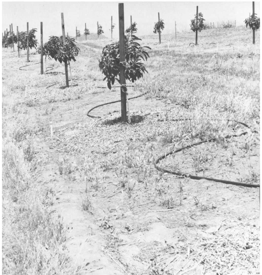
One of the blocks of Hass avocados being irrigated with the drip irrigation system. Also visible in photo is the installed, but as yet unused sprinkler irrigation system available if the drip irrigation system should fail.