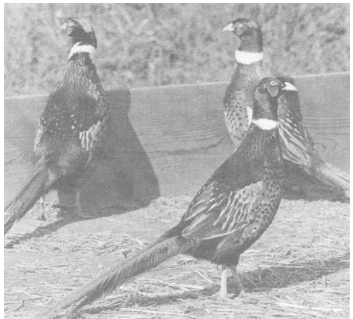
Mongolian pheasants in rearing pen.