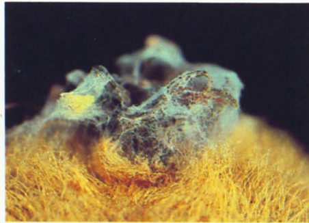
Below, left: Alternaria surface mold infects flower parts, such as these adhering styles. Center: Alternaria mold also may develop on sepals as they wither during storage. Right: Alternaria associated with severe sunburn produces hard, dry rot.