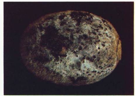
Above, at left: Typical stem-end rot caused by Botrytis , the most serious kiwifruit storage disease. Center: "Nest" of botrytis rot in packed fruit stored under high humidity. Right: Sclerotia developing on fruit blacken the surface.