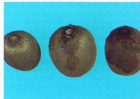
Wetness from exuding juice often accompanies phomopsis rot in kiwifruit.

Careful handling and proper storage are crucial to avoid postharvest losses