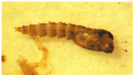
Culicoides variipennis (adult, above, and pupa, left) is widely distributed, especially in southern areas of the state. It often occurs in sites such as dairy lagoons, where dense populations expose animals to high biting intensity.