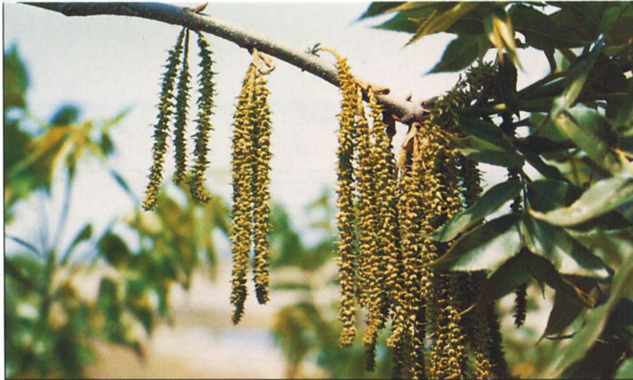
Staminate pecan flowers.