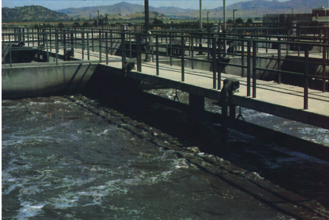
Activated sludge, secondary treatment of municipal wastewater.