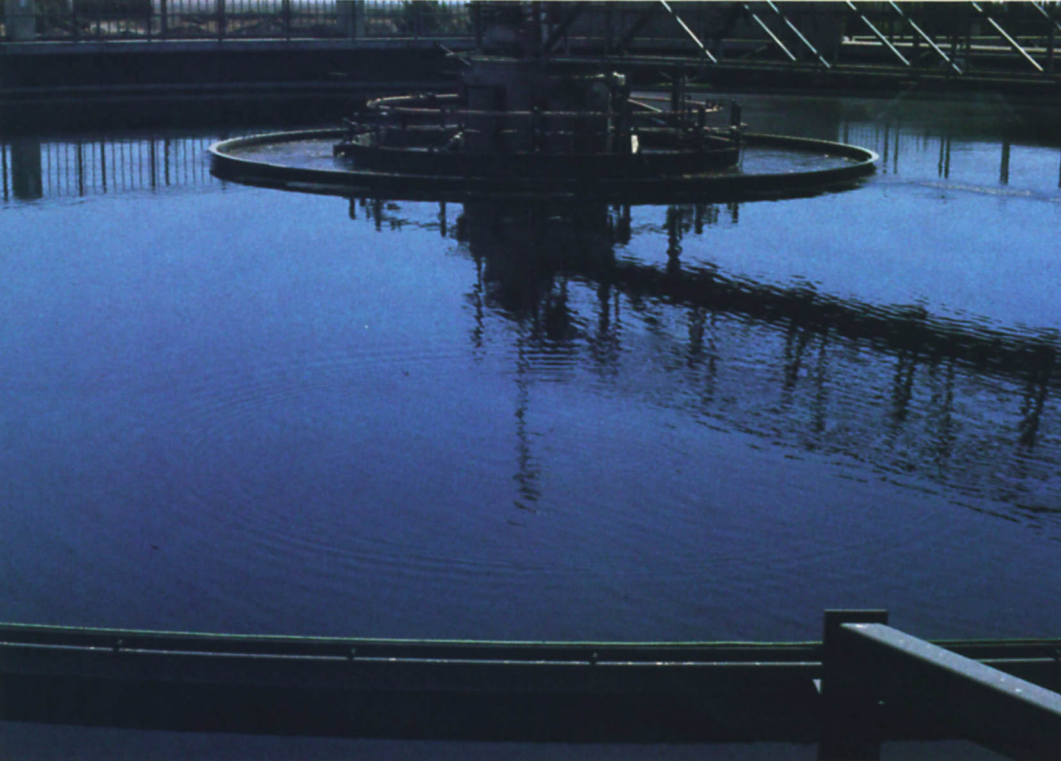
A secondary clarifier in which sludge settles before effluent undergoes dual-media filtration.