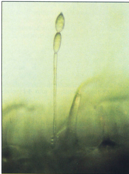
Powdery mildew spores (conidia) and spore-bearing structures (conidiophores).