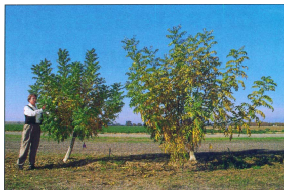
Jack Kelly Clark

Approaches to modifying tree growth. UC Davis geneticists Abhaya Dandekar and Gale McGranahan have modified walnut for improvement in root characteristics of the rootstock and bearing habit of the scion. Dandekar and McGranahan have taken genes from Agrobacterium rhizogenes , which stimulates root production. They have introduced three genes — rol A, B and C — from the bacterium to Paradox trees, a common walnut rootstock variety. Field testing of the transgenic trees have shown that they are vigorous and more compact than nontransformed trees.