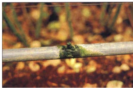
Occasional water treatment may be necessary to keep algae and chemical deposits from plugging the sprayers.

Of the three center riser systems we examined, all had high levels of uniformity, with an average DU of 85%. The sprayers themselves had excellent uniformity and most of the reduction in DU was caused by pressure differences along the mainline. In one system, the pressure-regulating control valves along the mainline were not set