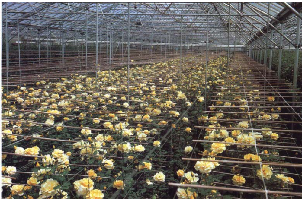
Commercial cut-rose production in a coastal California greenhouse. Irrigation water applied uniformly to production beds can enhance production and quality of the rose crop and help to conserve water.