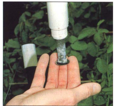
Inexpensive screens can help keep foreign materials such as sand and rust flakes out of the sprayer lateral. In this photo, pipe joint compound collected in the filter after a new irrigation system was installed.

Microirrigation systems used in greenhouse cut-flower production should attain a DU of over 85%. However, in this survey, the average DU was only 75% and ranged as low as 51% (table 1). The lower the DU, the more water is required to meet crop needs. The amount of extra water needed to ensure adequate irrigation could be estimated by dividing the water requirement by the DU. Relative to a system with a perfect 100% uniformity, a system with a DU of 85% requires about 18% more water than the crops need to make sure that the drier areas receive enough water ( 1.0/0.85 = 1.18 ). An irrigation system with a DU of 51% would require nearly 70% more water than one with a uniformity of 85%. Often, this amount of extra water is not applied, and in some areas, there may be yield losses due to water stress. In other areas, yields may be reduced due to the