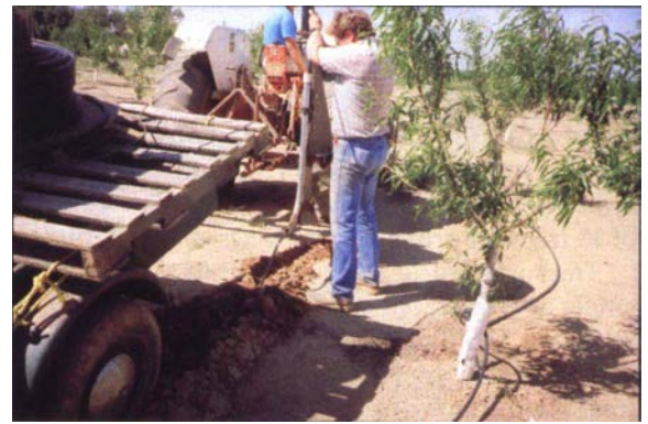
Two configurations of subsurface drip were installed 16 inches deep: a single lateral line, 2 feet from the tree row, and two lateral lines per tree row, each 4 feet from the trees.

Summer weeds grow according to the wetting patterns of the microirrigation patterns. The microsprinklers in the foreground encourage more weeds than the subsurface drip in the back.