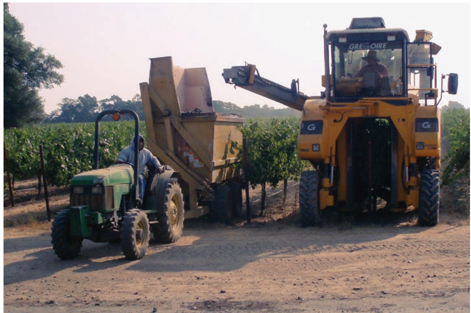
Lange Twins Winery, based in Acampo, credits the Lodi commission as "a catalyst in shaping our philosophy. We have developed our sustainable techniques through their guidelines."

The Farm*A*Syst workbook model had two attributes that other self-assessments, such as the Positive Point