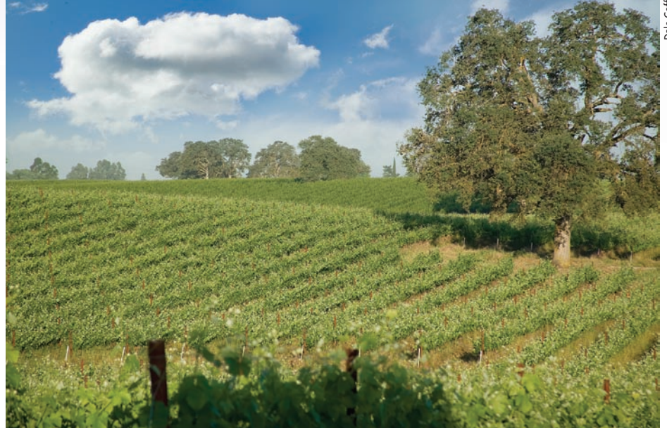
Growers in the Lodi region have embraced sustainable winegrowing practices since the early 1990s.

The California wine industry, relative to other U.S. agriculture sectors,