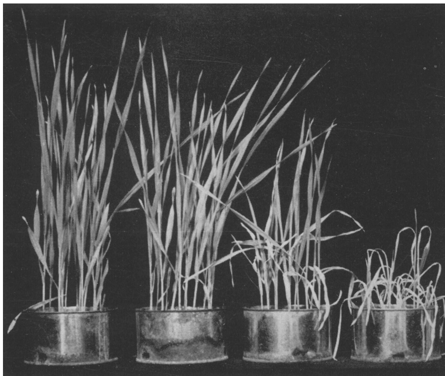
Fig. 1. Treatment of barley with hexene vapor, 15 minutes in each instance. Concentration from left to right: 0, 4.3, 7.1, and 10.0 mM/l of air. Original injury 0, 0, 25, and 95 per cent respectively. Photographed 10 days after treatment. Plants third from left are recovering.

First noticeable is the escape of foliage odor. This is definite, and it indicates an increase of permeability, at least with respect to these volatiles. Plants can release such odors and still fail to exhibit serious injury. As further evidence that an increase in permeability has occurred, very slight pressure on the leaf will darken it, owing to cell sap filling the intercellular