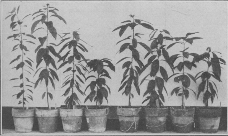
Fig. 2.— Phytophthora Cinnamomi was added to the soil in the 4 pots on the left. Controls, on the right, were untreated. Soil in all pots was watered when necessary. Six months later all avocado plants were still healthy.

Previous inoculation experiments by the writer, in Africa, had indicated that under normal soil conditions Phytophthora Cinnamomi does not affect avocado plants adversely. Tucker (see footnote 7, p. 521), also, states that avocado plants growing under healthy conditions were not