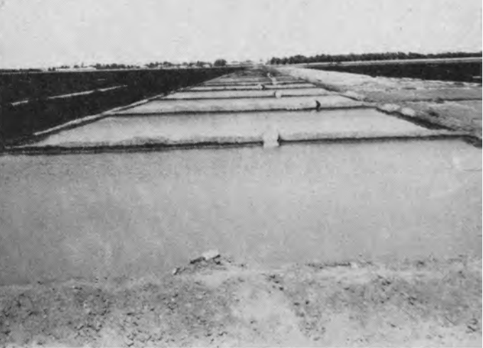
CALIFORNIA AGRICULTURE, MARCH, 1954