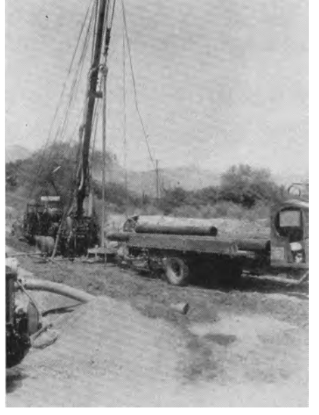
Drilling an experimental drainage well.

Some 800 piezometers have been installed throughout the Valley on a half mile grid pattern, and are read periodically to show the rise and fall of the water table and the direction of groundwater movement. At spots where potential danger is indicated, additional pie-