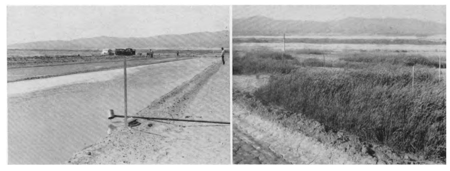
CALIFORNIA AGRICULTURE, MARCH, 1954

Oat crop on leaching plots. Growth was closely correlated with the amount of leaching water passed down through the profile, to about 4' depth.