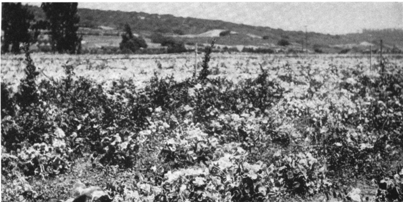
Selective weed killer plots in nasturtium seed field in Lompoc Valley three months after treatment. Lower right—MCP-sprayed morning-glory. Lower left—Non-sprayed morning-glory.