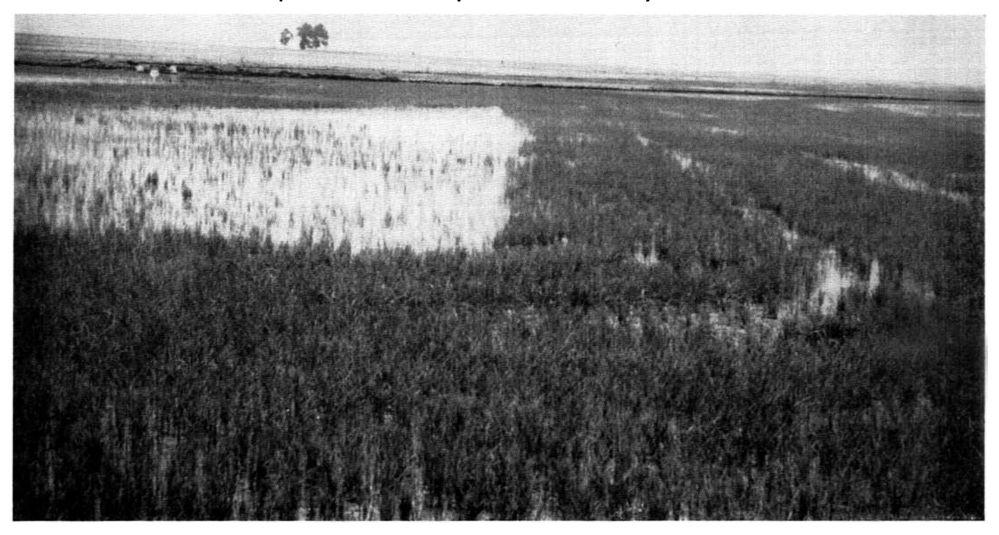
An outstanding response from ferric sulfate in a rice field near Grimes. This area was treated with 700 lbs. of ferric sulfate per acre. Note the skip marks where the easy flow missed.

The fifth group, soil both saline and alkali, is represented by a single test. The soil had 66% exchangeable sodium, Concluded on page 14