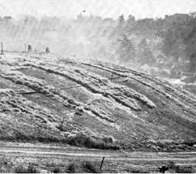
Grass plots established in irrigated area of the test site.