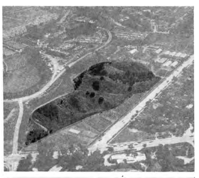
Edge of University of California campus at Los Angeles showing hillside area along Veterans Avenue at Sunset Boulevard used as demonstration site for conversion of chaparral growth to low-fuel density plantings.