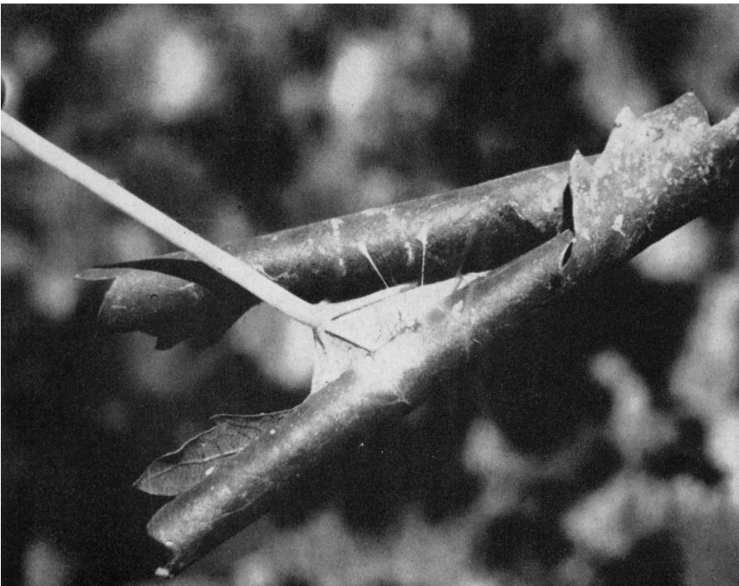
Rolled grape leaf in photo resulted from infestation by grape leaf folder. The rolls are formed from webbing as the larva develops within.

— Frederik L. Jensen is Farm Advisor, Tulare County.