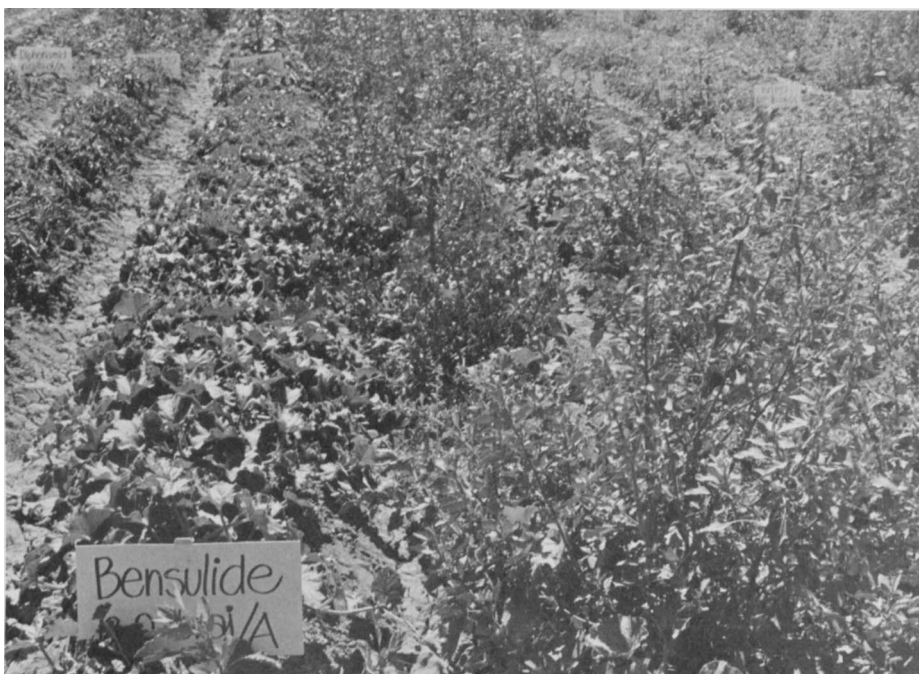
Annual broadleaf weeds being controlled in melons by pre-emergence application of bensulide (Prefar), left, in contrast to untreated plot to right.

If nightshade and groundcherry species build up after the extended use of trifluralin or diphenamid for tomatoes, a shift can be made to corn or milo and weeds can be controlled with atrazine; or a shift could be made to carrots and linuron, or the combination of another crop with an herbicide could be used that is effective against weeds in the potato family ( Solanaceae ).