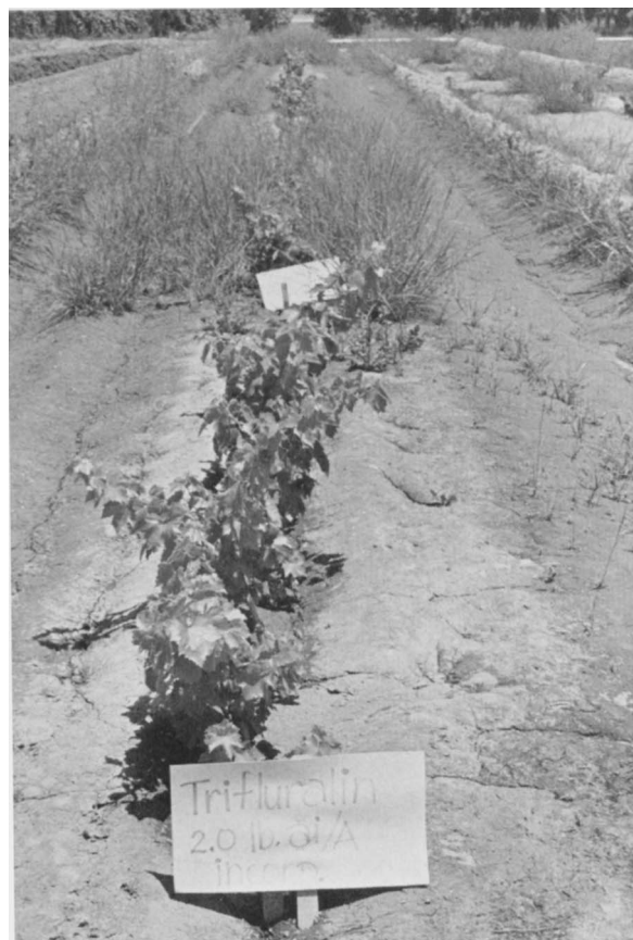
Annual grasses are easily controlled season-long with trifluralin (Treflan) applied at planting of young dormant grape vines. (Note weedy untreated plot in background).