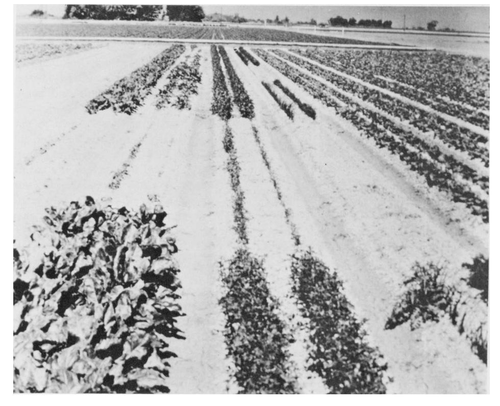
Reduction in stand and growth is shown for the 4 lb (twice label rate) of Kerb. Crops were planted 84 days after a treatment to a lettuce crop which "failed."

The experiment reported here was designed to evaluate the effect of Balan and Kerb on 13 crops which could be planted