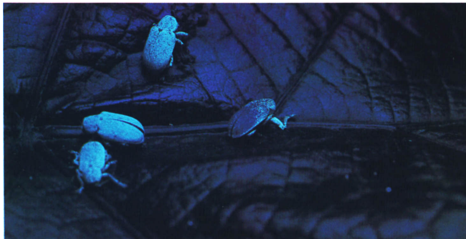
While trying to identify with an ultraviolet light beetles that had been marked with fluorescent dye, the author discovered that unmarked beetles glowed silvery-blue under UV. The discovery helped in studying the beetle's movements.