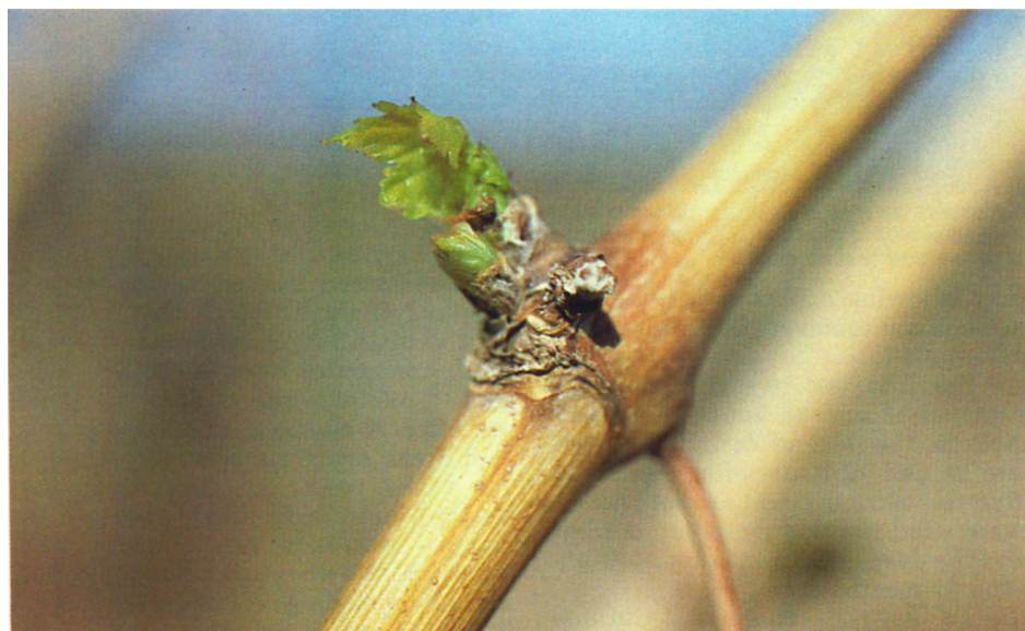
Adult grape bud beetles can heavily damage grapes by feeding on opening buds.

It is difficult to detect adults at night with a flashlight, because the beetles blend in with the color of the bark, spurs, canes, and vine supports. Through very unusual circumstances, we found that grape bud beetle adults