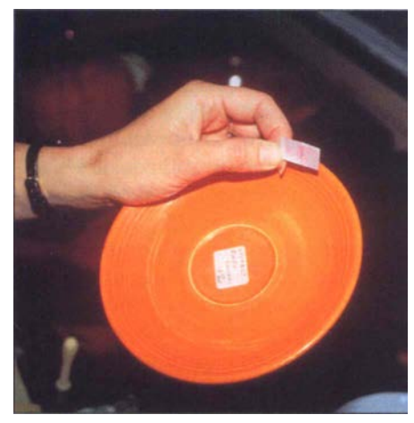
▲ The UC Quick Lead Test indicates by color change, from clear to pink, that lead has leached out of this saucer.

◀ More than half of the ceramic ware manufactured in Mexico tested positive for lead leaching.