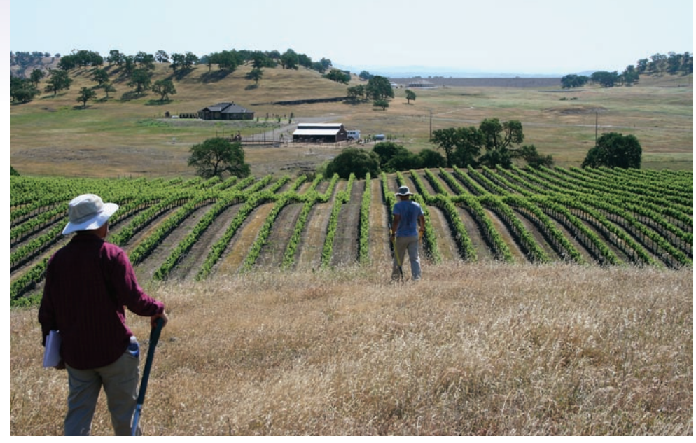
The Lodi Winegrape District of San Joaquin and Sacramento counties encompasses a wide range of soil types, on which about 100,000 acres of wine grapes are grown.

The Lodi Winegrape District is one of the largest in California, with approximately 750 growers and about 100,000 acres in production in San Joaquin and Sacramento counties. This district encompasses a wide range of wine-grape varieties, production systems and soils.