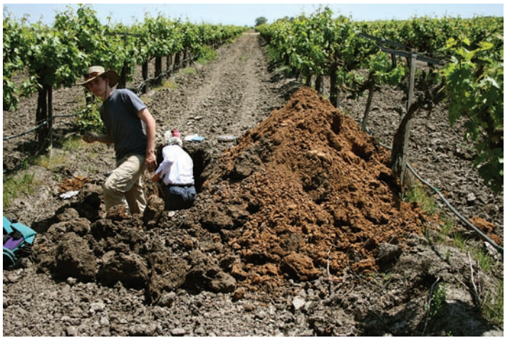
To assess the potassium status of different soils, the authors took soil samples throughout the Lodi Winegrape District to reveal differences in parent materials and degree of soil development.