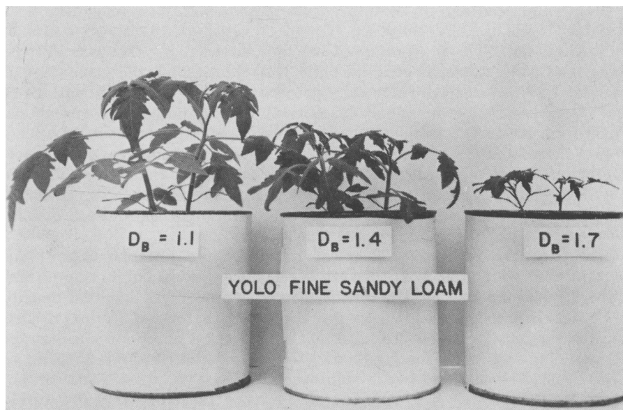
Fig. 2. Effect of levels of soil bulk density of Yolo fine sandy loam on the height of tomato plants six weeks after seeding.

purpling on the ventral side of leaves, with occasional small patches on the laminae. There was a slight marginal spotting on the dorsal side of the laminae. Plants grown on soil at bulk density 1.1 showed no signs of purpling.